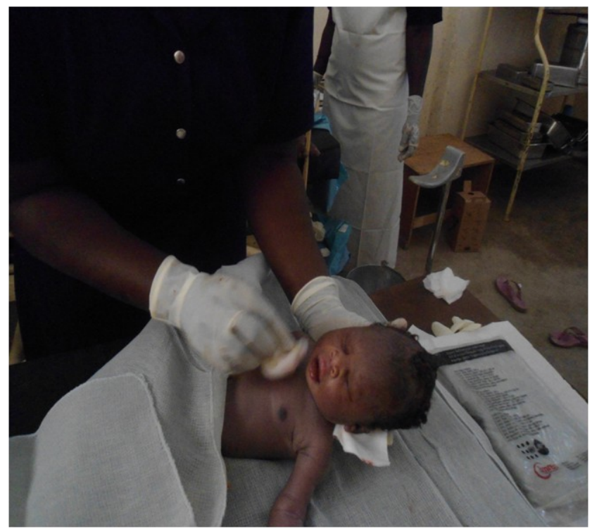
First baby delivered in Malakal Teaching Hospital after the onset of the crisis. The delivery was assisted by UNFPA and IOM midwife team.

Delivery service has also been resumed in Malakal Teaching hospital through the support of UNFPA and IOM midwife team.